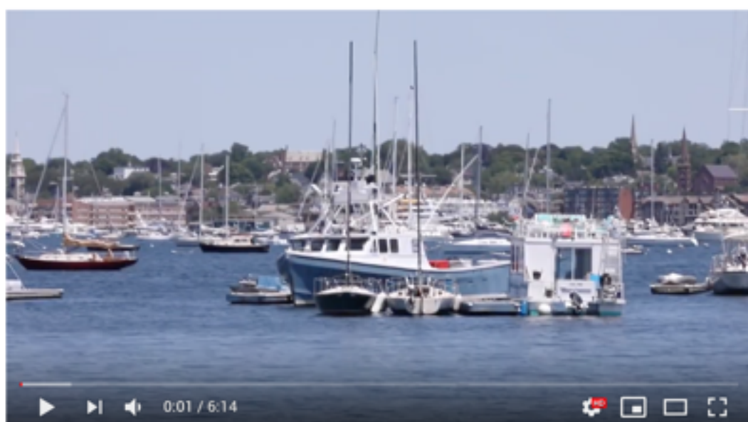
Sustainable Workforce Development Network

“It was enlightening for me to learn how disconnected our youth in our region are from our local industry. We have an absolute opportunity for Chambers of Commerce, working with local professional associations and organizations (i.e. from Blue Tech) and local government business development agencies, to engage united in an educational career and workforce development outreach program with our High Schools and Higher Ed Institutions. Students have high aspirations, helping them recognize and identify paths knowing what local industry and government incentive programs are, can offer them the opportunity to help them develop their dreams and ultimately ignite local communities with much needed solutions to local challenges. Blue Tech represents roughly 75% of the Earth footprint. Imagine what we can accomplish if we could develop the missing 50% capacity to address our Blue Tech promise and challenges. I look forward to staying engaged and helping this great workforce development initiative.”